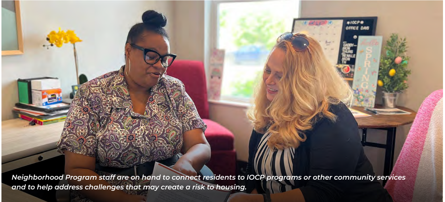
Neighborhood Program staff are on hand to connect residents to IOCP programs or other community services and to help address challenges that may create a risk to housing.